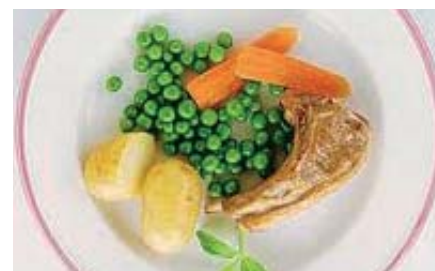
That's more like it!

I would suspect that the most difficult change would be to cut down on the food you buy, cook or order. So, look at what you buy and resist the 3 for the price of 2 offers, don't buy on impulse (take a list and stick to it). Dish up smaller portions of meat, cut down on cooking fats and oils. See how you get on – More next time.